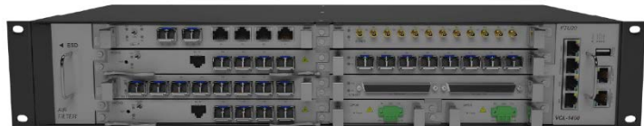
VCL-1400 - 7 Slot with expansion chassis