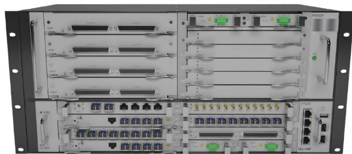
VCL-1400 - 7 Slot with expansion chassis